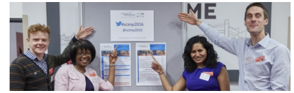
Improvement Academy Clinical Leadership Fellows 2016/17

Are you an aspiring leader in Health? Would you like to join our dynamic team to work on a diverse range of fantastic projects making a change to our health systems? If yes, applications to join the Improvement Academy as a Clinical Leadership Fellow have now opened and we are welcoming applications from specialist trainees, nurses, midwives and allied health professionals. For more information, read our brochure here , talk to our current Leadership Fellows (details below) or to apply directly on the Health Education England website, click here . CLOSING DATE 1st DECEMBER!